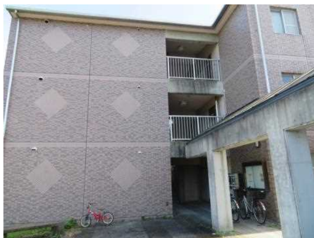
the couple room and family room building