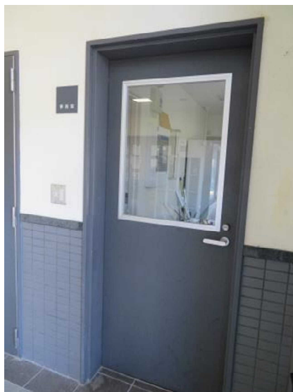
* Office room (No permanent staff is working here)