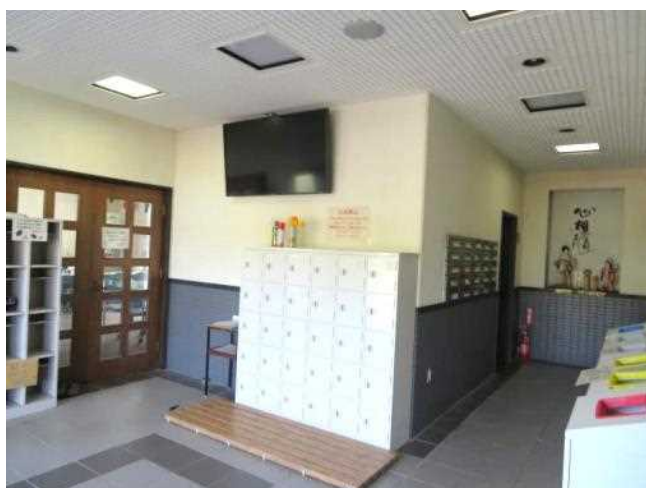
* Entrance hall