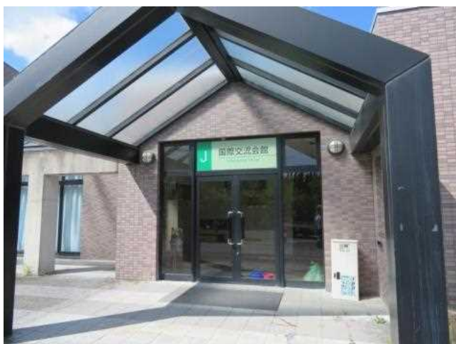
Shared space and the single room building