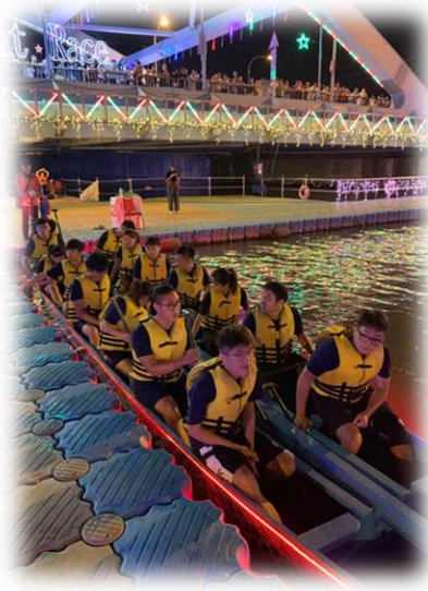
DRAGON BOAT FESTIVAL