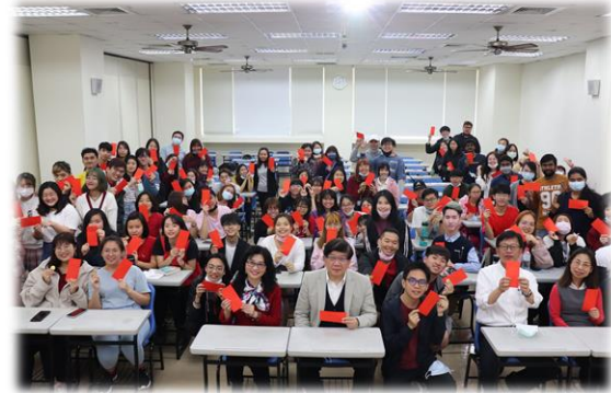
CHINESE NEW YEAR